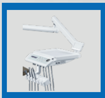
Central control version