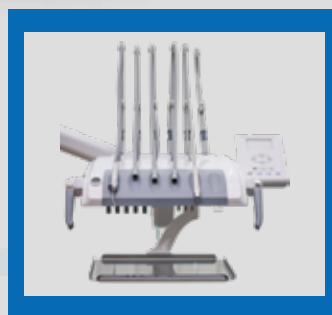
Top mounted version