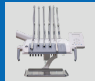
Top mounted version

Optional to be Top Mounted Version with Stitched leather