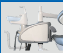
90 degree rotating side box