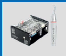
Built in scaler